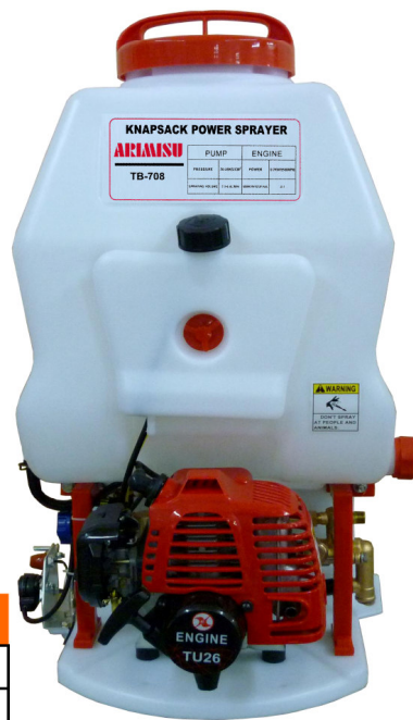
TB - 708 25 LITER