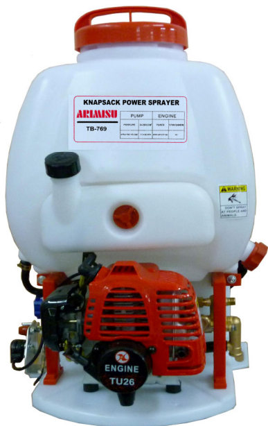
TB - 769 15 LITER