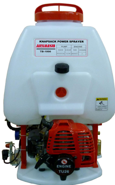
TB - 1000 20 LITER