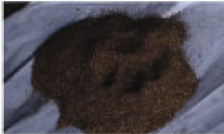
Coconut Shell Powder