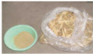
Corn Leaf (Dry)