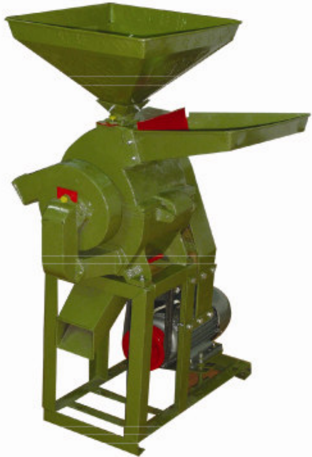
This machine can drive by electric motor or diesel engine